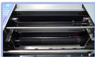
Roller gap setting refer to Page 6