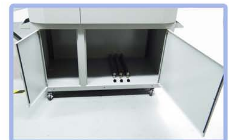
Huge stand cabinet (Bars in picture are not standard)