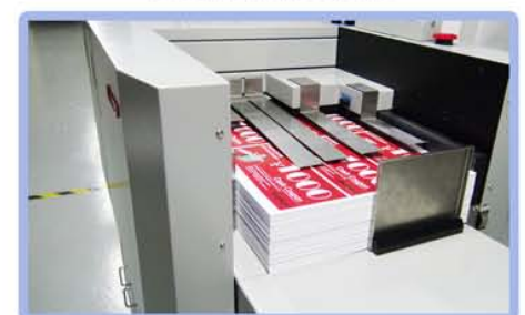
Top suction infeed table