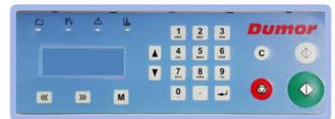
Secondary control panel on Fold unit