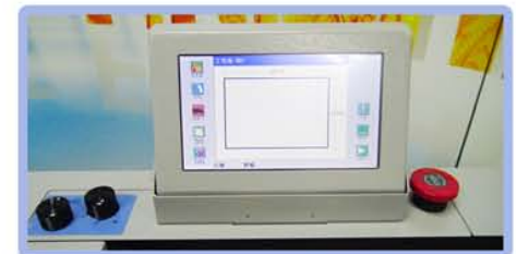
Main control panel Color touch screen