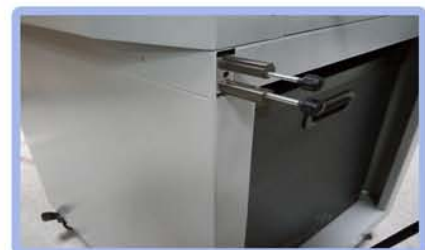
Tools and waste bin