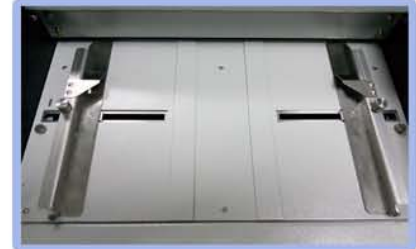
Centre register table with skew adjustment