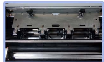
Cutter, Slitter and Gauge