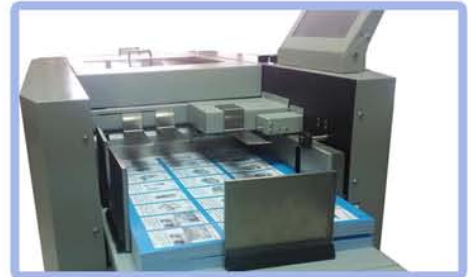
High pile feeder