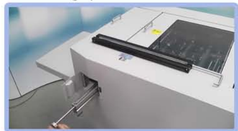
Cross Perforation bar Crease bar