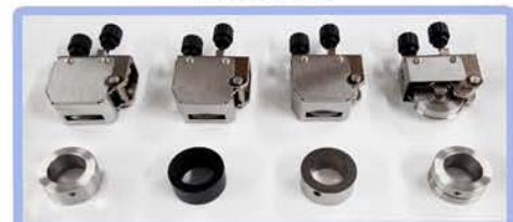
Slitter Perforator Kiss cutter Scorer